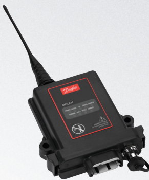
MPCAN Adapted to vehicles with CAN Bus communication External LEDs for troubleshooting CANopen