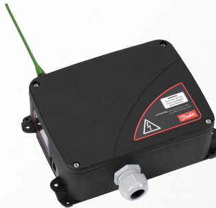
R13 F The customized solution for industrial cranes Up to 21 digital outputs