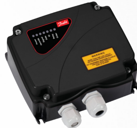
R06 The hoist receiver 6 digital outputs External LEDs for troubleshooting