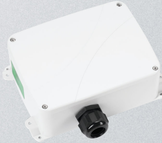
R13 ATEX Z2 The receiver for hazardous areas zone 2 Explosion proof 13 digital outputs