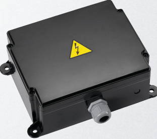
R70 Flexibility for any application 29 digital and 8 analog outputs