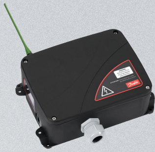
MP20A/MP20V When service is paramount 12 digital and 8 analog outputs External display for troubleshooting External removable EEPROM SIM module