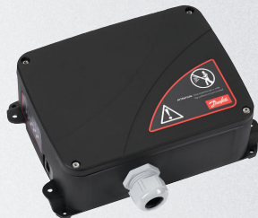
R13 B The standard solution for industrial cranes 13 digital outputs External LEDs for troubleshooting