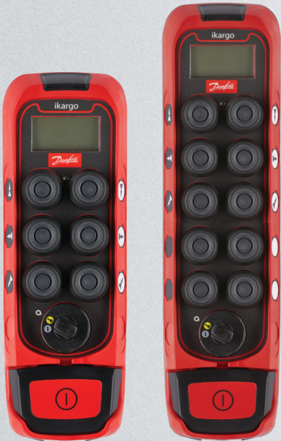
IKARGO 1 IKARGO 2