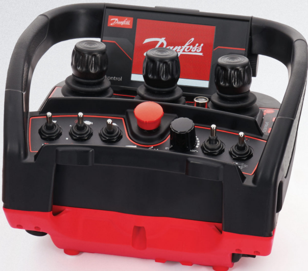
IK 3 When service meets design