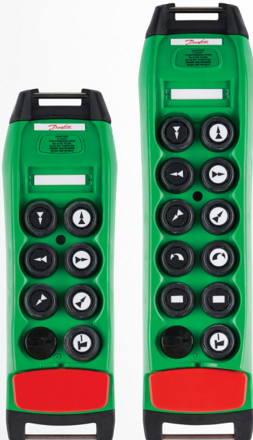
T70 1 ATEX T70 2 ATEX