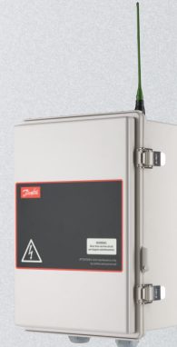
R70 PLUS Endless possibilities 53 digital and 8 analog outputs