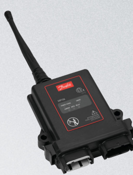
MP08A/MP08V Mobile applications in reduced spaces 8 digital and 4 analog outputs External LEDs for troubleshooting