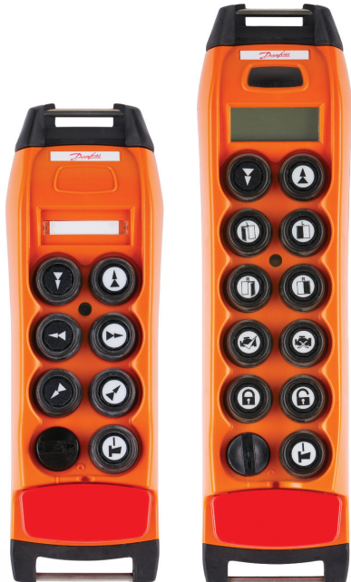
T70 1 T70 2